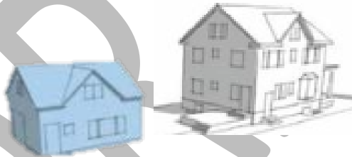
Example of Detached ADU.

C. “Detached accessory dwelling unit” means an accessory dwelling unit that consists of a building that is separate and detached from the primary single-family housing unit. Examples include converted garages or new standalone construction.