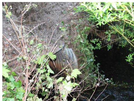
Covington Creek side of culverts