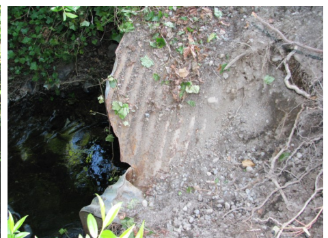
Side view of culvert