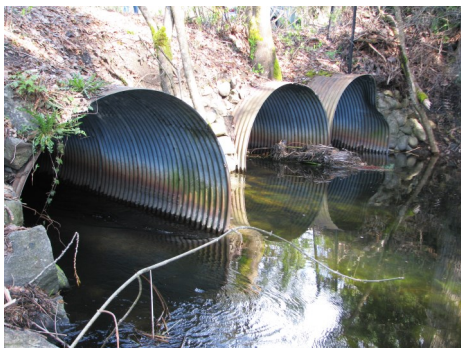
Lake Sawyer side of culverts